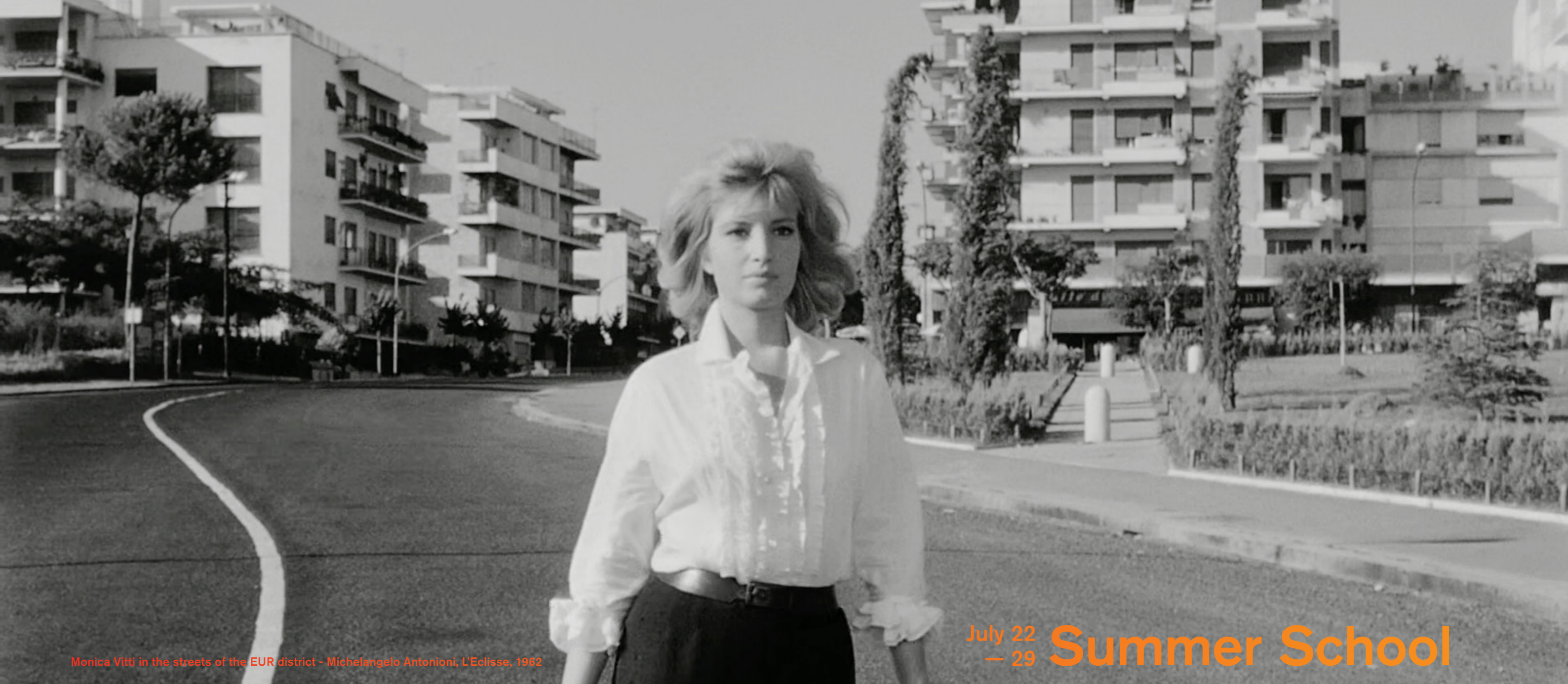
Monica Vitti in the streets of the EUR district - Michelangelo Antonioni, L'Eclisse, 1962